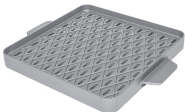
12" x 12" Pan