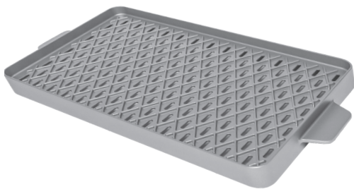
12" x 18" Pan