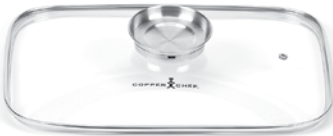
GLASS LID WITH OIL INFUSER†