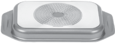
GRILL PAN* (underside)