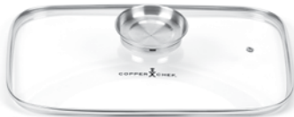
GLASS LID WITH OIL INFUSER†