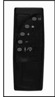
Remote Control (2 AAA Batteries)