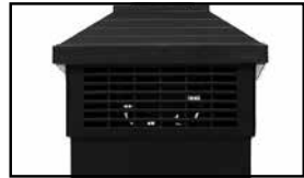
Air Inlet Vent (Back)