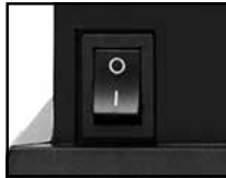
Power Switch (Back)